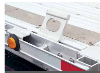
Cargo hands as internal anchor points