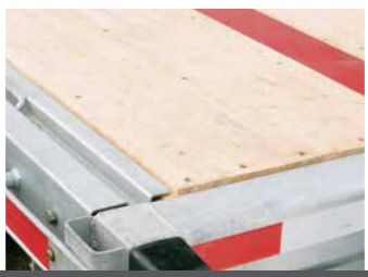
Wood floor available