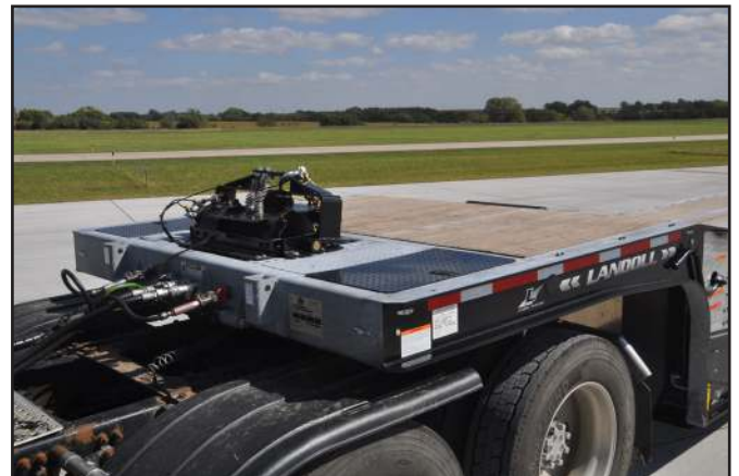
Easy Hook Up Hydraulics Upper Deck Lighted Toolbox