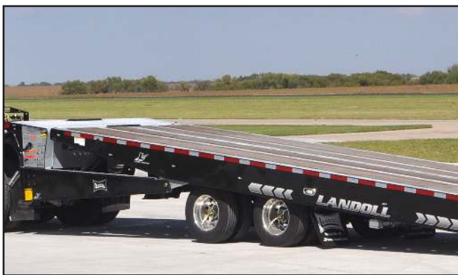
Smooth Transition to Upper Deck