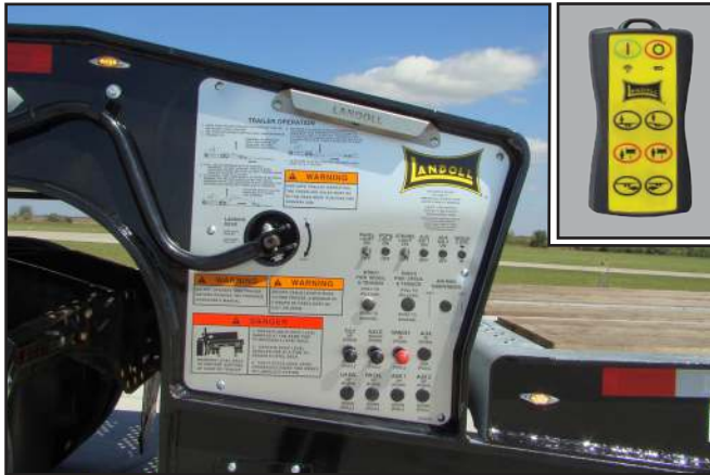
Easy to Operate Control Panel Enhanced Lighted Control Panel Optional Wireless Remote Control