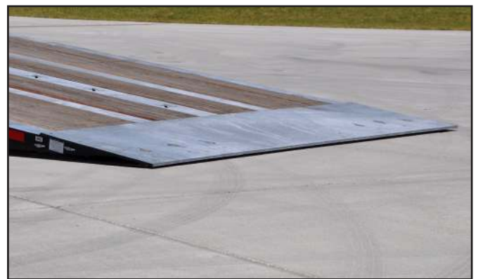
6.5° Low Load Angle

Proven Solutions for Your Hauling Needs! 1-800-428-5655 | www.landoll.com/trailers